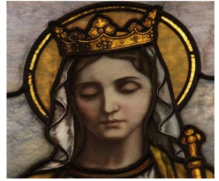
Saint Monica 331 -387