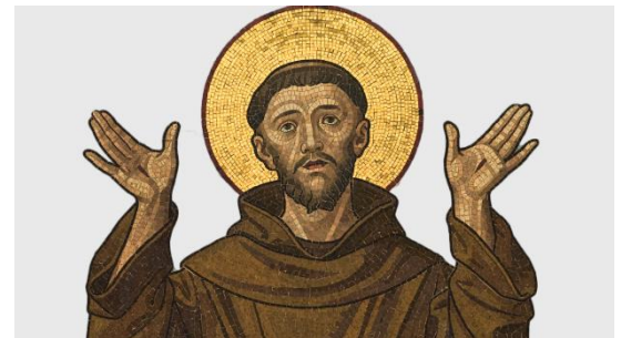
- St Francis of Assisi Wednesday-